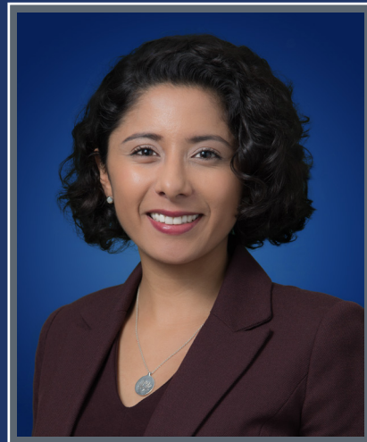
Harris County Judge Lina Hidalgo